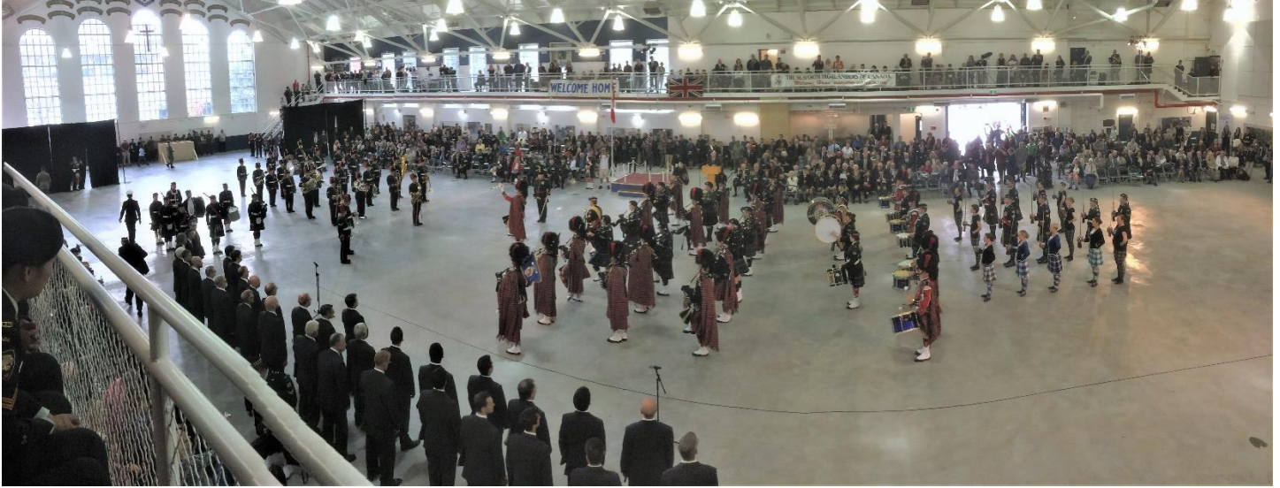
The finale of the military tattoo that took place as part of Operation Highland Homecoming, the reopening of the Seaforth Armoury.

Operation Highland Homecoming was a great success. It was excellent to see so many members of the Association on parade, in the hollow square, as they dedicated the regiment's newest battle honour, Afghanistan. A wonderful day.